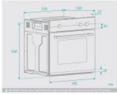
SALINI Built In Oven | SOB-500DH